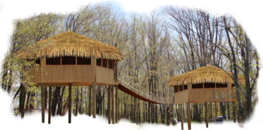
(not an actual photo)